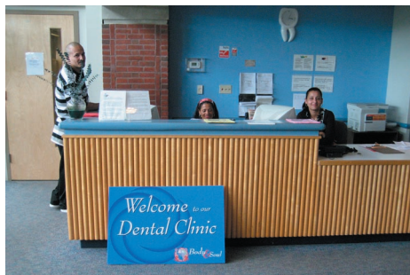
Dental screenings took place in the Dental Clinic