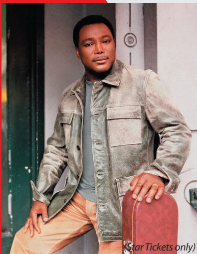
(Star Tickets only)

For more information, please contact the Office of Development and Communications