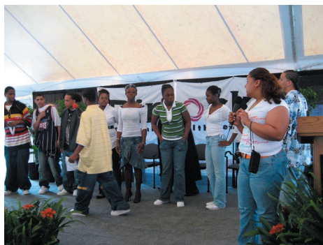
The Teen Center's HIV Awareness Fashion Show