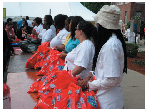
Volunteers hand out gift bags to attendees